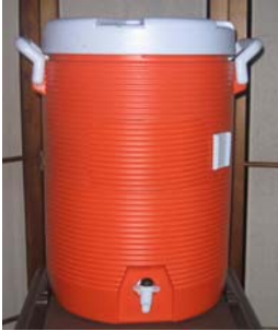
5 Gallon Drink Cooler